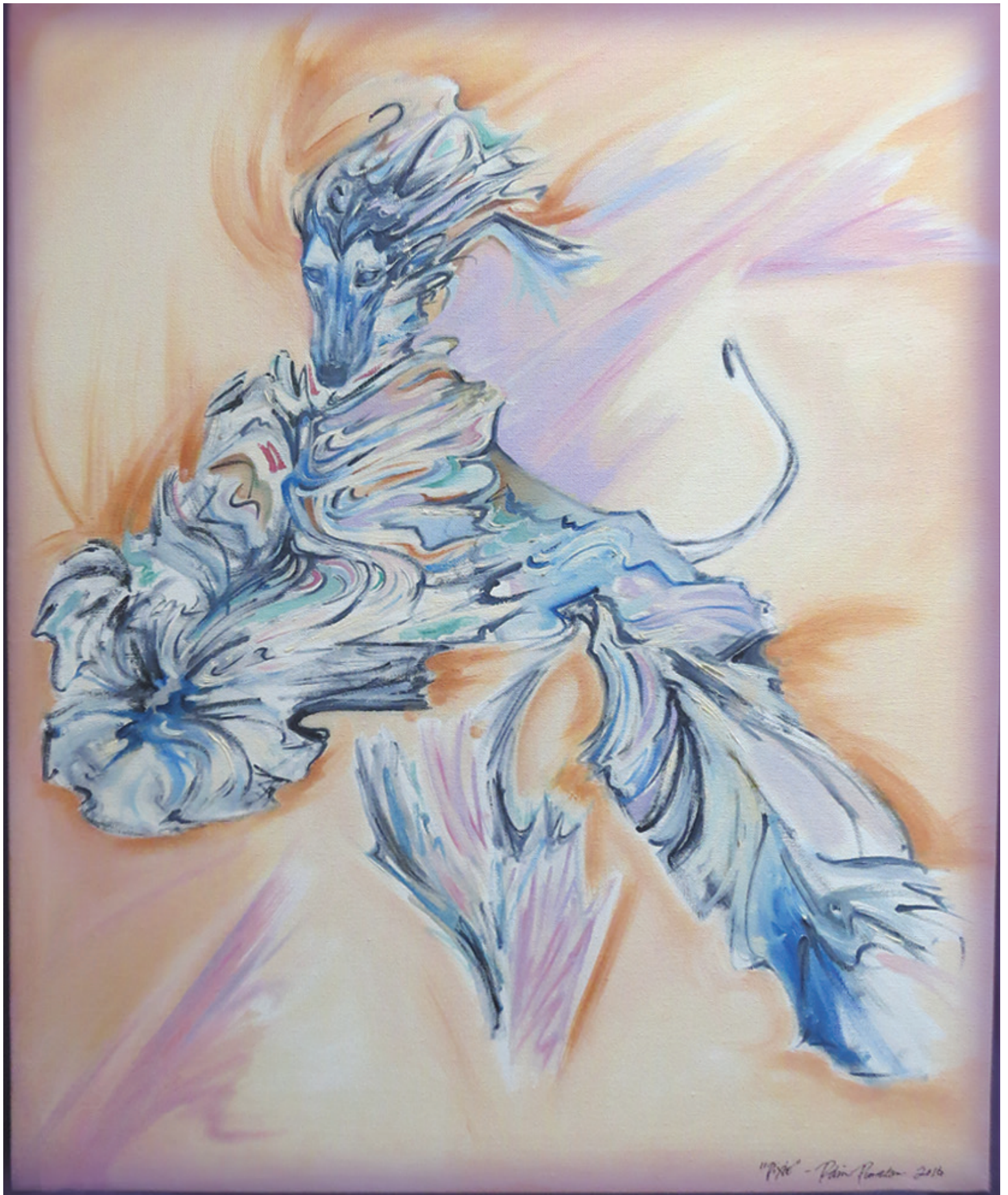
"PIXIE" - ROBIN PUNSALAN