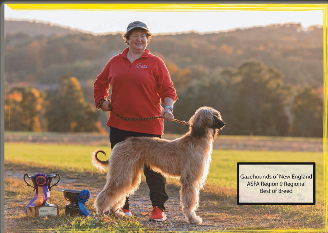
Gazehounds of New England ASFA Region 9 Regional Best of Breed