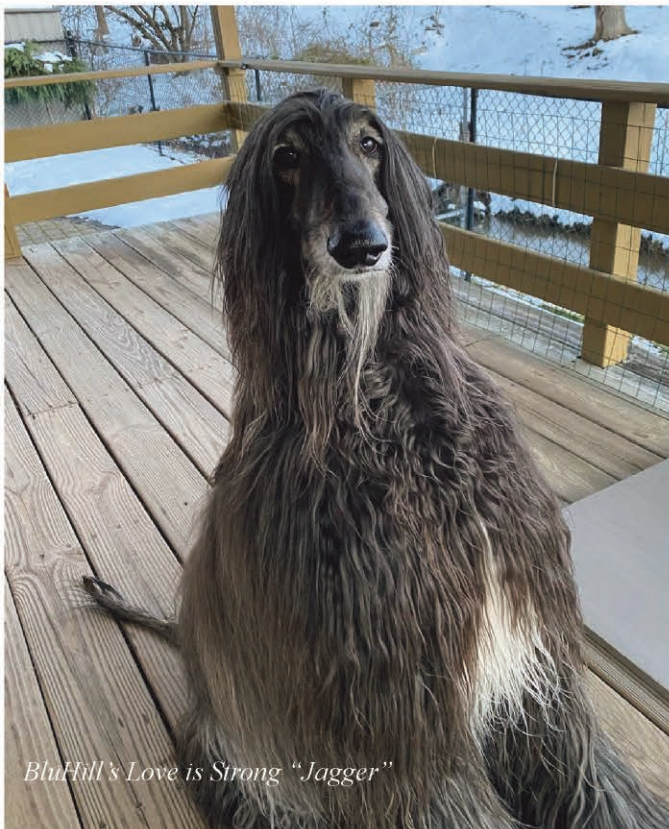
BluHill's Love is Strong "Jagger"

Okay, now it your turn to share! Make us all proud of our Afghan Hounds! I am so very proud of my Afghan Hounds who serve as therapy/assistant dogs. I will gladly continue as the point person for this column and gather stories (unless someone else wants to volunteer. Hint!) Send photos and articles to me at Darlam723@gmail.com . 🐾