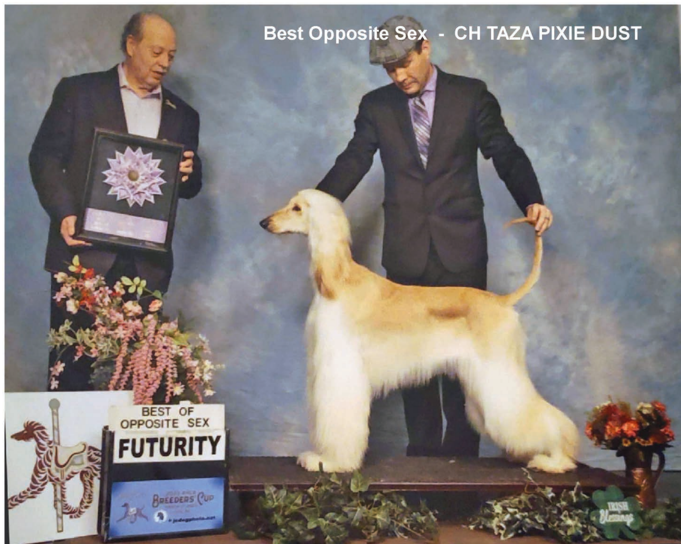
Best Opposite Sex - CH TAZA PIXIE DUST