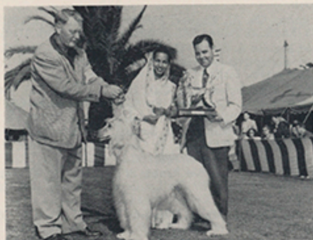
CH. FELT'S ALLAH BABA

GREETINGS FROM CROWN CREST! FOR A VERY SUCCESSFUL SHOW!