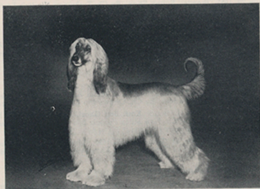
INT. CH. MAJARA MIRZA